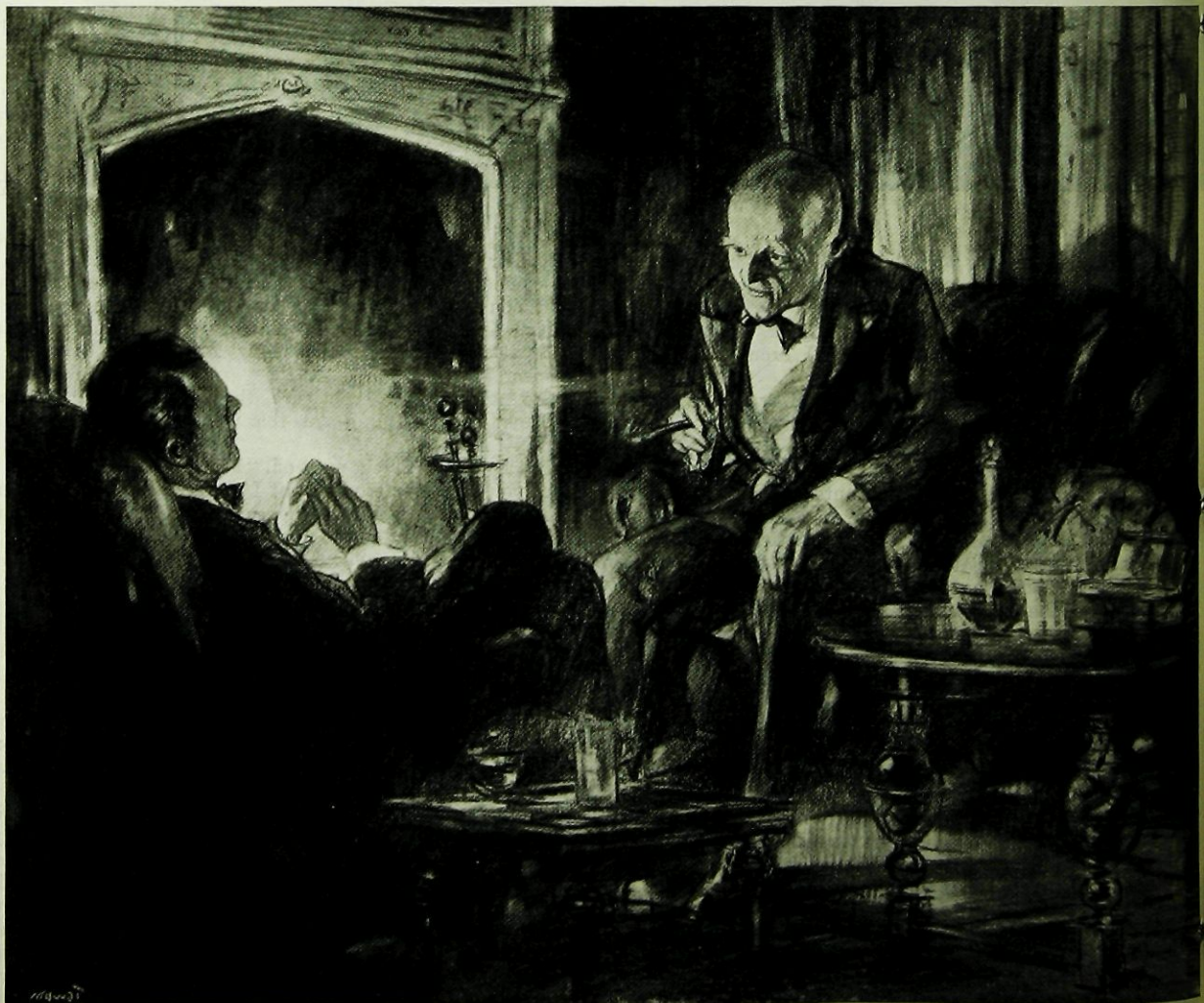
"I Got Myself in Position to Get What I Wanted, and I Got It. I Got Absolute Privacy"

When the Commodore said that, I was gazing at the ceiling of his library. I was about to remark that the beam ends and panels had been carved and painted by Elizabethans who knew their job and